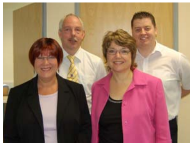
The Community Liaison Team

Community Liaison Team or the Doncaster Federation of Tenants and Residents Associations. Our details are at the end of this booklet.